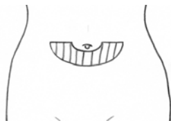
Belly Button (navel)