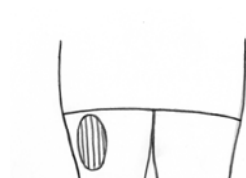
Upper Outer area of the thigh